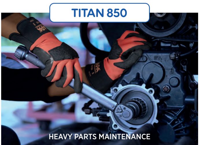
Heavy-duty work with cut risks